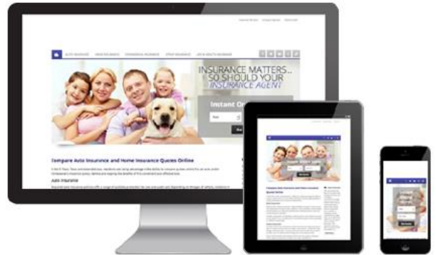
PROFESSIONAL DESIGNS OPTIMIZED MOBILE VIEWING

Professional One-Time Site Copywriting Professional Weekly Blog writing Original Content Verification by Copyscape ® Quarterly Performance Meetings Unlimited Online Customer Support Easy-to-Use Website Editor Dedicated Website Consultant Personal Phone Support Monthly Consultation